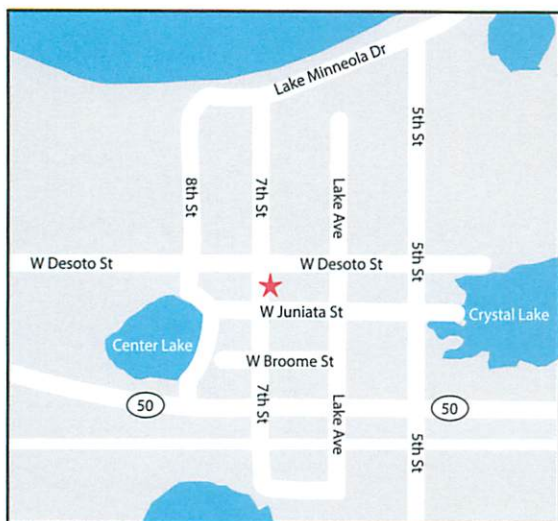
Historic Downtown Clermont